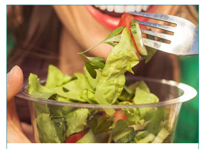
21st International Conference