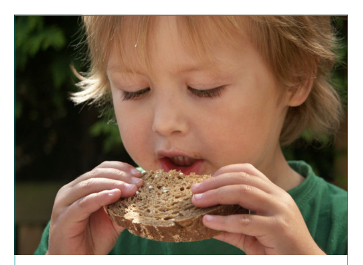
15th International Conference